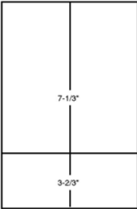
Laser-Edge Perf at 3-2/3" From Bottom of Sheet