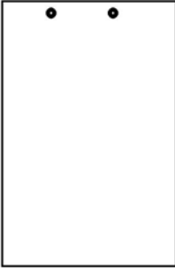
2 File Hole Punch Top 5/16" Holes 2-3/4" Center-To-Center