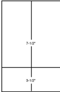
Perf 3-1/2" From Bottom