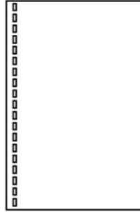
19 Hole (a.k.a. GBC)