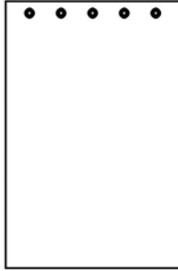
5 File Hole Punch Top 5/16" Holes 1-3/8" Center-To-Center